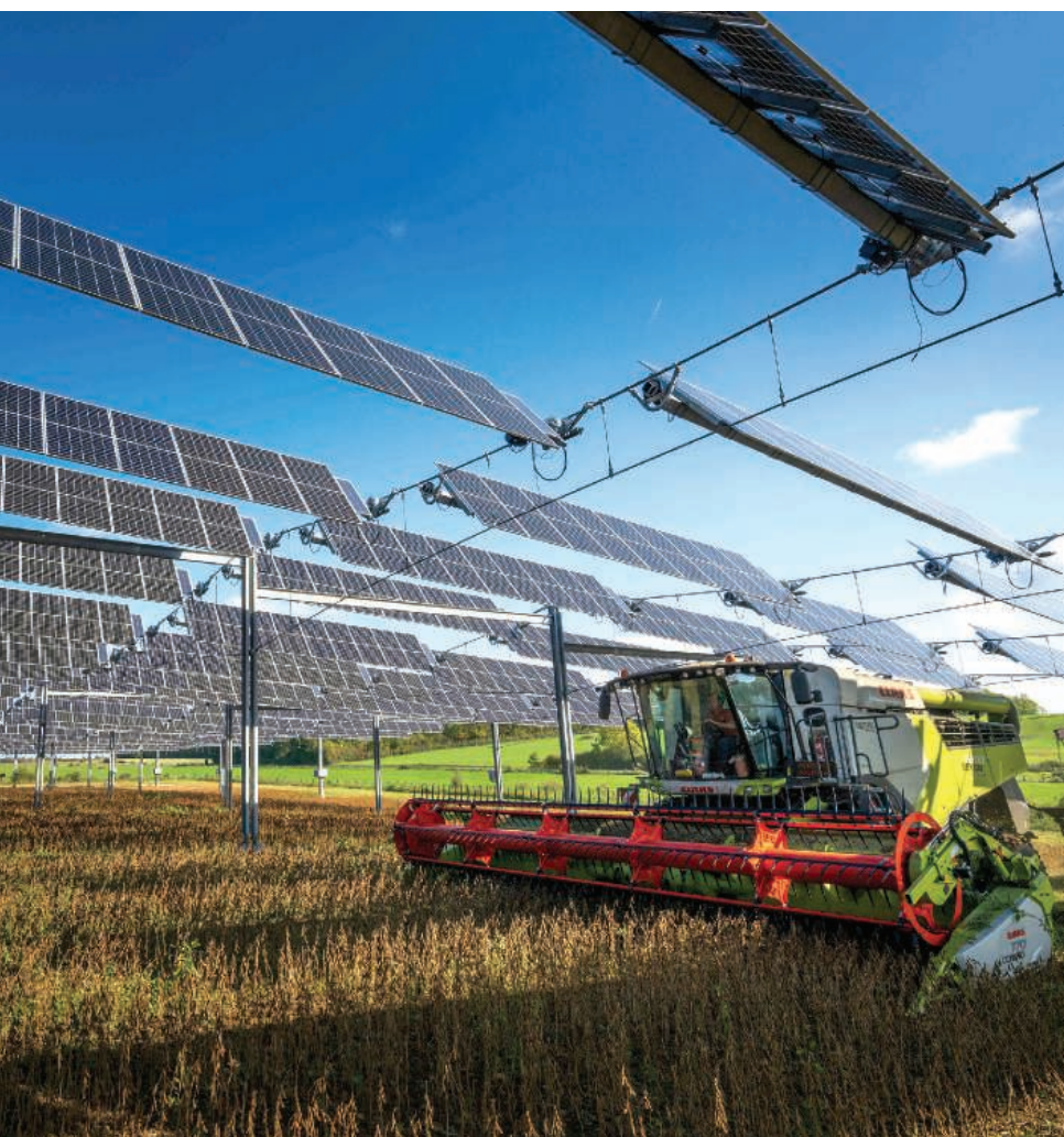
Double-usage of land is demonstrated at this Agrivoltaic site in Amance, France, where the simultaneous use of land for power production and agriculture can also reduce irrigation needs in arid lands.

revenue needed to build and operate a generator over a certain period), where innovations are quickly introduced to the market and where technology transitions happen in months to a few years. Examples of these include hydrogenation for defect control, diamond wire sawing, multibusbars, half-cut cells, and increases in wafer size. The latest tunnel oxide passivated contact silicon (Si) PV technology (commonly known as TOPCON) advanced in 5 years from an industrially relevant laboratory design to commercialization and mass production. Fundamental advances in materials chemistry for cadmium telluride (CdTe) PV have recently also made their way into production in record time. Recent analysis shows that it now takes about 3 years for the average cell efficiency in mass production to reach the efficiency of the champion cell fabricated in the industrial laboratory (6).